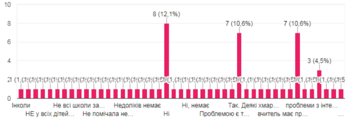
Fig. 2. What problems do you encounter when using cloud-oriented services?

PLE has demonstrated multidisciplinarity, since the main task of designing such medium is to enable the student to receive correct, timely and verified information in a format that is convenient for him/her at any given time. The teacher can independently determine the environment which the students will connect to and the means for cooperation, communication.